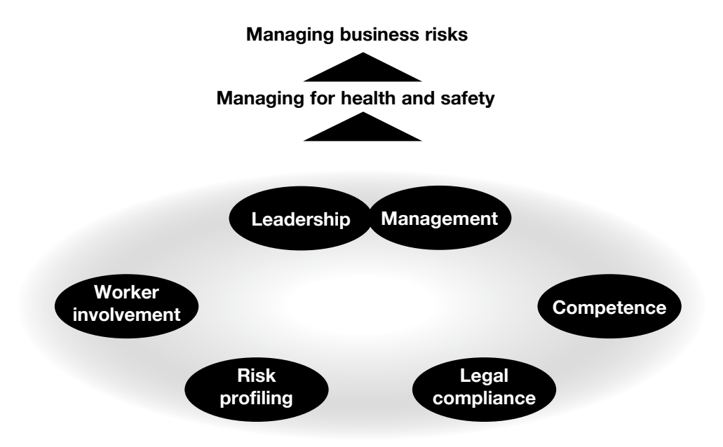
Figure 1 The core elements

HSE provides advice and templates on these processes – see our risk management site for more information (www.hse.gov.uk/risk).