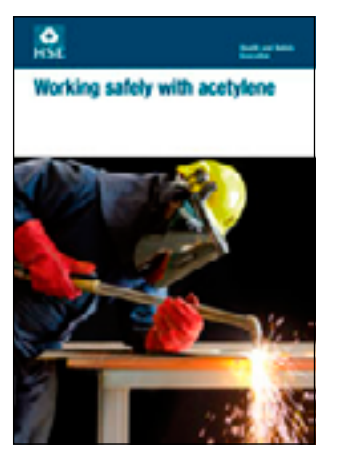
This is a web-friendly version of leaflet INDG327(rev1), published 07/14