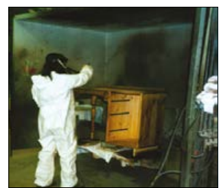
Figure 7 Walk-in booth