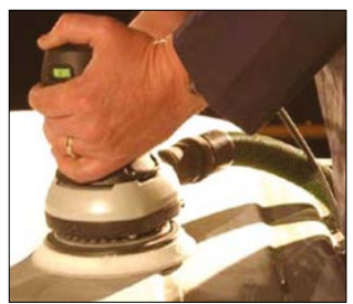
Figure 3 On-tool extraction hand sander