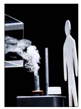
INDG408(rev1) Published 01/16

A simple guide to buying and using local exhaust ventilation (LEV)