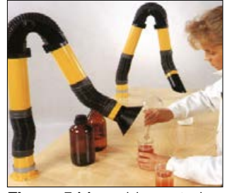
Figure 5 Moveable capturing Figure 6 Small booth hood